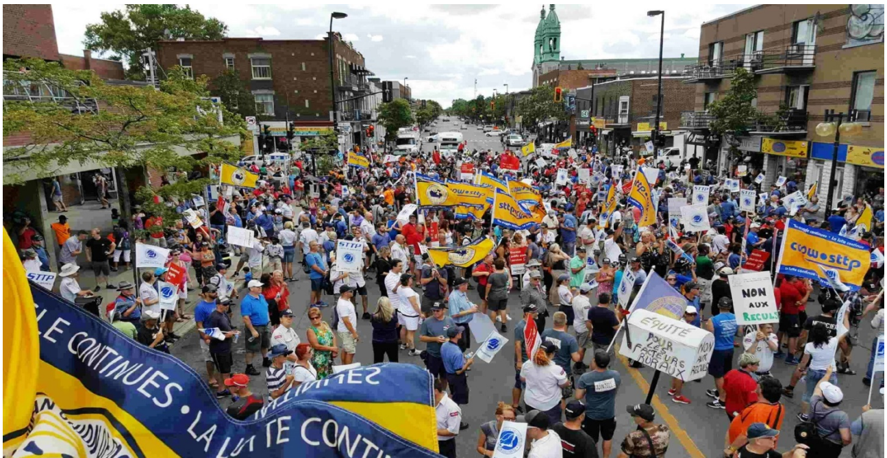
A view of the crowd at the rally.

On Saturday, over 1000 postal workers and allies gathered in Montreal and marched to Prime Minister Trudeau's constituency office to deliver our message to the government. It is time for Canada Post to negotiate seriously with us and address the issues that are key to achieving new collective agreements.